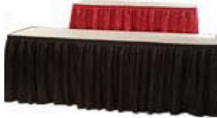
Table Skirt Color: _____ blue _____ red _____ burgundy _____ black _____ green _____ yellow _____ white

(Standard table height is 30in. Add $40 for 40in high skirted table.) (All sizes skirted on three sides. For skirt on 4th side, add $40 on 30in tall table, $60 on 40in tall table)